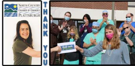
The North Country Chamber, United Way of the Adk Region, and area residents donated more than $11,500 to help support the Frontline Heroes in our 4 major hospitals. Thank you to all who participated in the Feed Our Frontline Campaign!