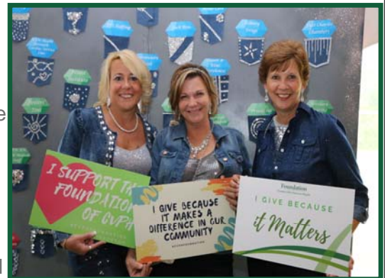
This picture was taken at last year's event, before masking and social distancing were required.

Visit UVMHealth.org/CVPHNon-Event for more information.