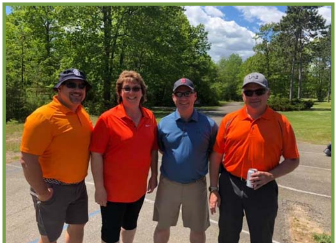
Photo taken at last year's event, before masking and social distancing were required.

Red Tees, Mulligans and 50/50 raffle tickets will be available at registration, and there are many great prizes to win! For more information and to sign up, head to UVMHealth.org/CVPHFoundation . We hope to see you there!